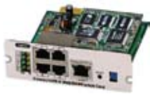
ConnectUPS-X Web/ SNMP X-Slot card