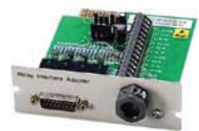
Relay Interface cards