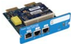
Power Xpert Gateway Card 2000