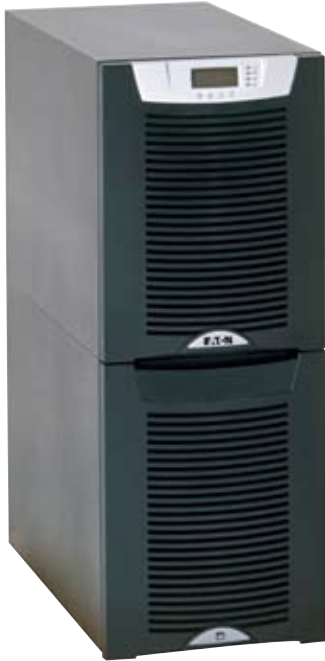
9155 8-15 kVA

Reliability and efficiency have never looked so attractive. The 9155 single-phase Uninterruptible Power System (UPS) delivers a combination of advanced technology, user-friendly design and low price that's absolutely unmatched by competing products. This innovative design offers high efficiency (90 percent or better across all load ranges), low input current distortion (less than 5 percent total harmonic distortion, with an active IGBT rectifier that delivers 0.99 power factor correction) and high power factor output (0.9 PF).